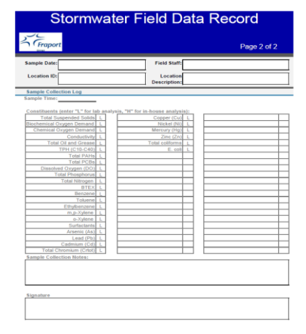
Figure 4: Storm water field data record. Airport Engineers have received relevant training in order to perform the sampling. Post sampling the airport staff fills in the relevant form.

✓ All the Waste Water Treatment Plants (WWTP) are monitored for treated effluent quality and re-use is performed in certain cases.