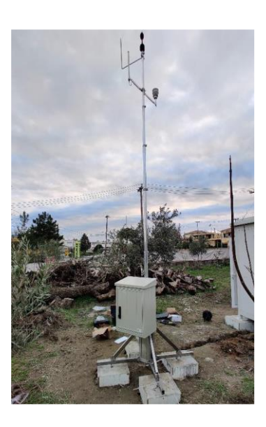
Figure 9: Noise monitoring terminal at Corfu (CFU) airport (MP01)

FG has set up a communication channel for the public via two email accounts (info@fraportgreece.com & environmental@fraport-greece.com) where complaints (e.g. for noise) or even proposals for improvement are received. After a complaint is received, related to environmental noise, the Environmental Management Section undertakes the actions to verify the source of the problem and implement all necessary corrective actions.