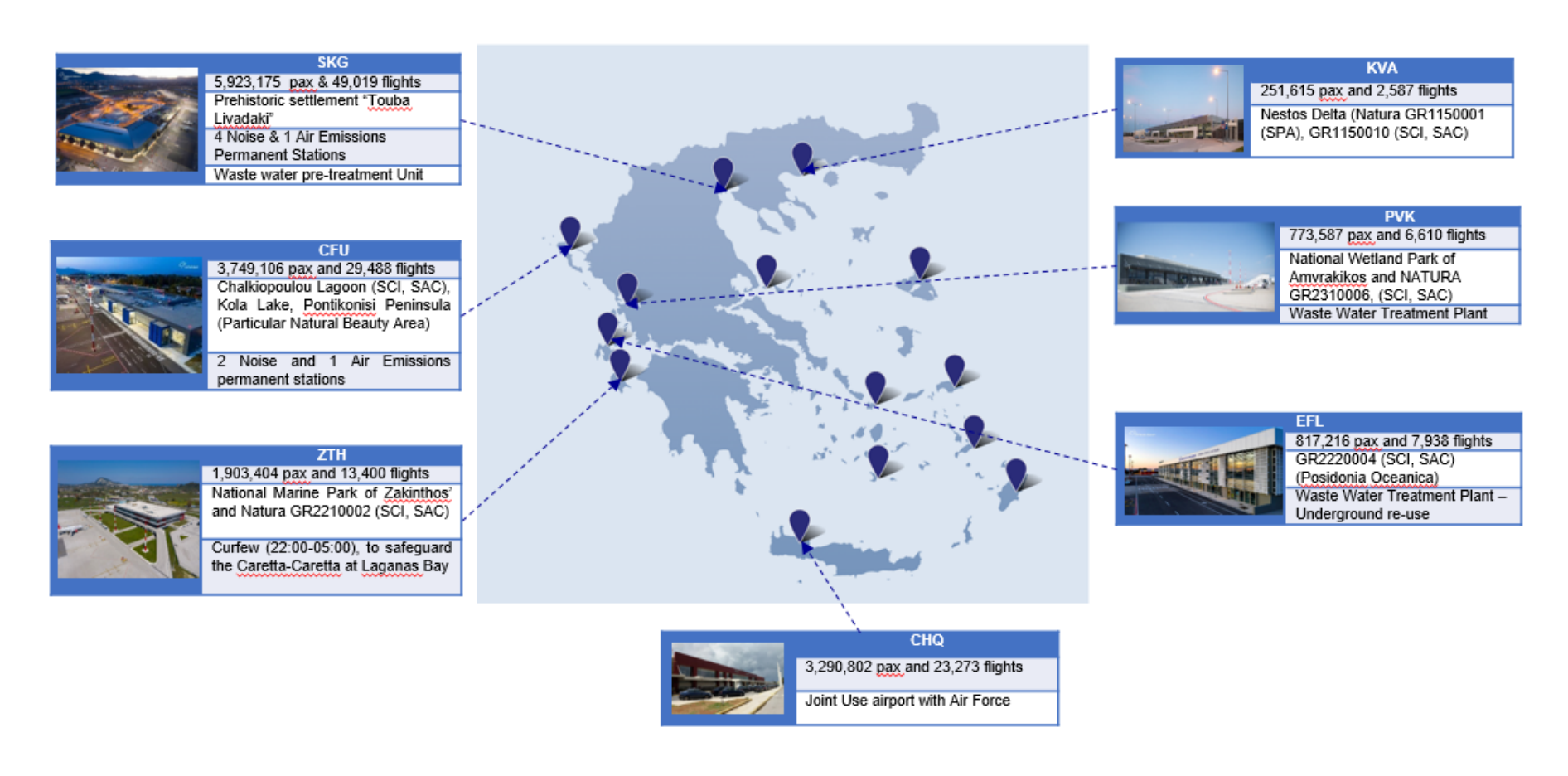
Figure 1: Fraport Greece Cluster A Airports