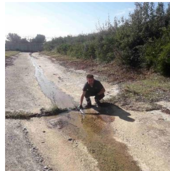
Figure 3: EFL storm water runoffs sampling