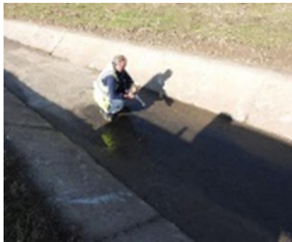
Figure 2: KVA storm water run-off sampling