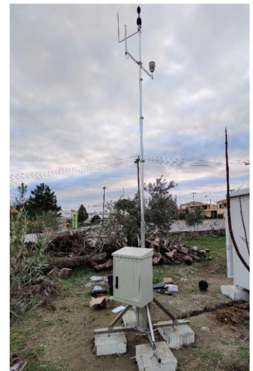
Figure 9: Noise monitoring terminal at Corfu (CFU) airport (MP01)

FG has set up a communication channel for the public via two email accounts ( info@fraport-greece.com & environmental@fraport-greece.com ) where complaints (e.g. for noise) or even proposals for improvement are received. After a complaint is received, related to environmental noise, the Environmental Management Section undertakes the actions to verify the source of the problem and implement all necessary corrective actions.