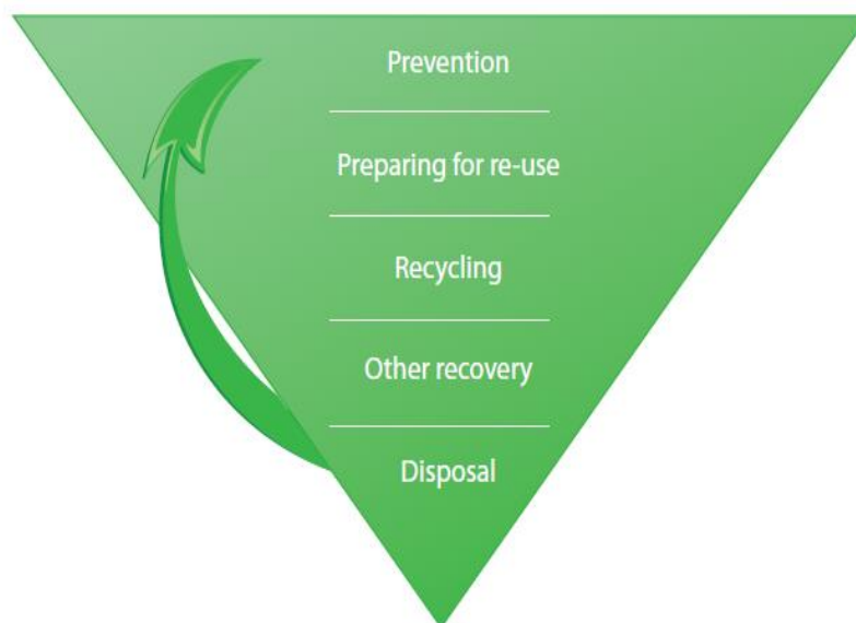
Figure 10: FG's waste management hierarchy

Recycling and re-use are both of great importance for FG and are being implemented, where possible, in both operational and construction waste.